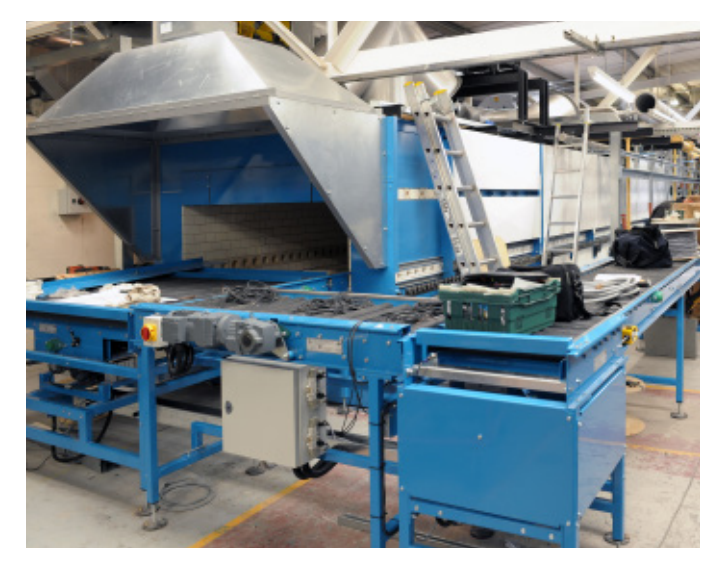
Pictured: New kiln currently being installed in our Stoke-on-Trent factory.