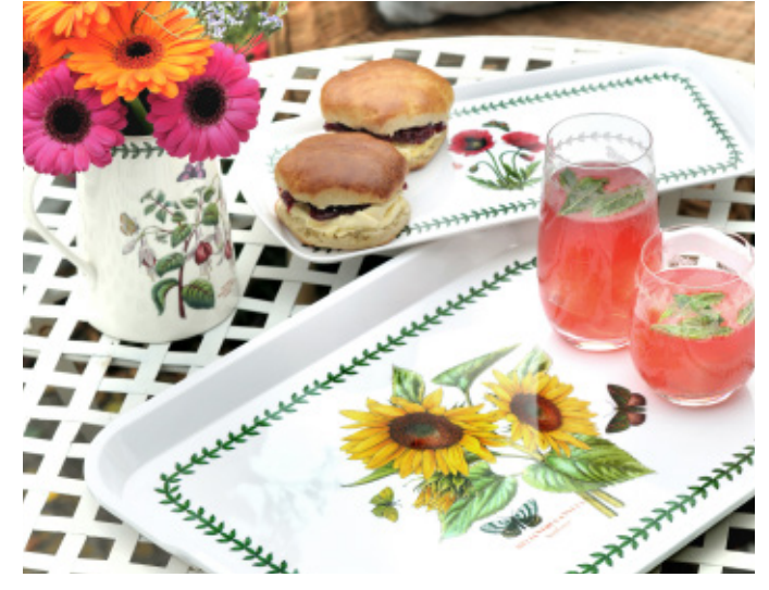
Pictured: Portmeirion Botanic Garden.